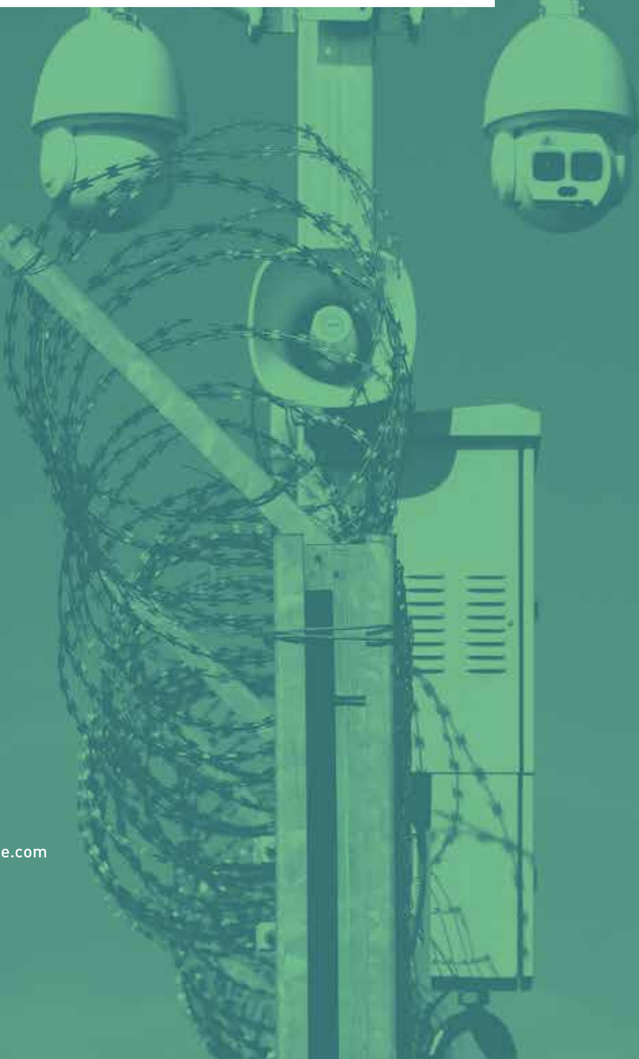
Border fence, Hungary.