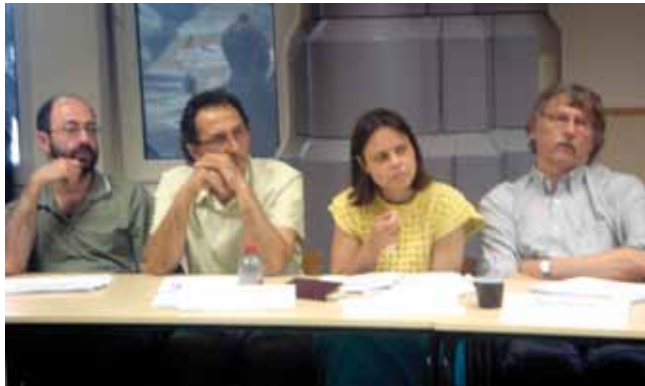
PICUM members listening to staff presentations during the Annual General Meeting in Brussels.

PICUM represents a network of members throughout Europe and at the international level which promote the fundamental rights of undocumented migrants. The membership shows a great diversity, including faith-based organizations, shelters, trade unions, humanitarian assistance providing organizations, which range in size from a larger organization with a sizeable staff to small, grassroots organizations that work primarily on the local level. Developing PICUM's network is an ongoing process and each year new members are voted into membership during PICUM's Annual General Meeting.