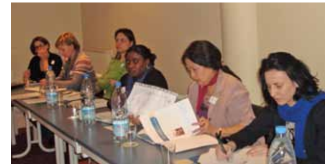
Participants review their notes during the one day PICUM Training on violence against undocumented women.

PICUM gave two key note presentations at Council of Europe events during the year to highlight key concerns regarding the situation facing undocumented migrant women. In May, at a Seminar on Migrant Women held in Kiev, Ukraine, PICUM highlighted the need to address the disproportionate impact of migration-control policies upon