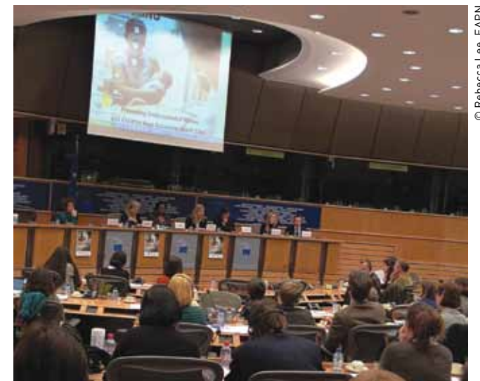
Over 250 participants attended the European Parliament hearing co-organized by PICUM on "Preventing Undocumented Pregnant Women and Children from Accessing Health Care: Fostering Health Inequalities in Europe".

Following the hearing and on the eve of International Human Rights Day, PICUM and the other co-organizers issued a joint press release calling on European and national decision-makers to take action to protect the rights and health of undocumented migrants by ensuring equitable access to healthcare for all, solidarity and the reduction of health inequalities, and implementing concrete policies with no discrimination linked to administrative status or financial resources.