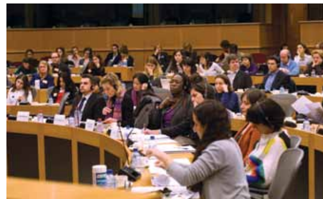
Participants listening to speakers presentations in the European Parliament.

PICUM made an important advancement in the EU political debate by co-organizing a hearing in December in the European Parliament entitled " Preventing Undocumented Pregnant Women and Children from Accessing Health Care: Fostering Health Inequalities in Europe ". This hearing was organized in partnership with Médecins du Monde, the European Women's Lobby (EWL) and the European