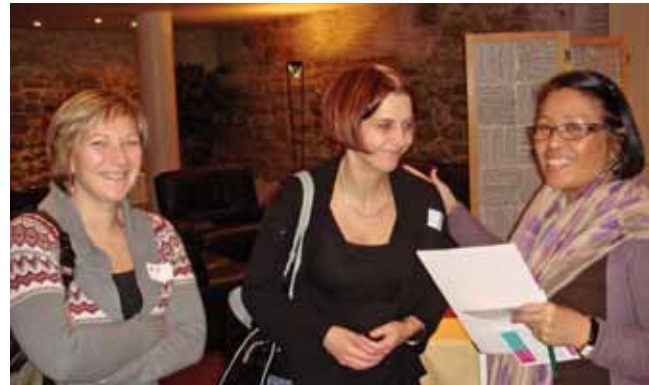
PICUM supported its members' participation in the training session on how to support victims of gender-based violence in December.

PICUM works to strengthen the capacities of its members through trainings, workshops, networking and information sharing throughout the platform. Membership fees allow PICUM to continue providing a high standard of expertise, information and support free of charge to those in need.