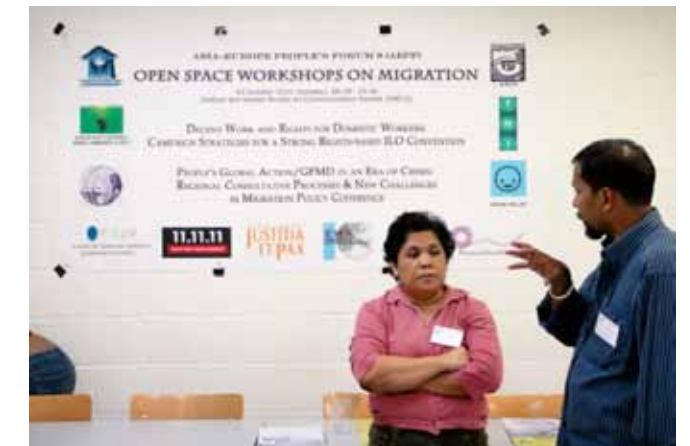
Participants discuss issues during the Asia-Europe People's Forum which discussed the rights of domestic workers.

These activities enabled PICUM to share insights into the problems domestic workers can face if they are, or become, undocumented and also, highlight the experiences of civil society organizations across Europe in advocating for their rights.