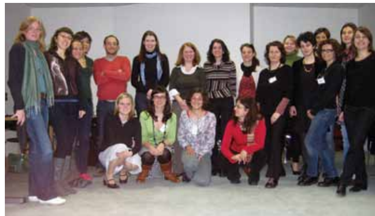
The ten FRIM fieldworkers and project coordinators met during the April kick-off meeting in Brussels, Belgium.

FRIM intends to provide policymakers with a scientific basis with which to take actions ensuring that the fundamental rights of undocumented immigrants are protected. By examining current problematic situations and documenting good practices, FRIM also intends to give practitioners practical tools to promote the rights of undocumented immigrants.