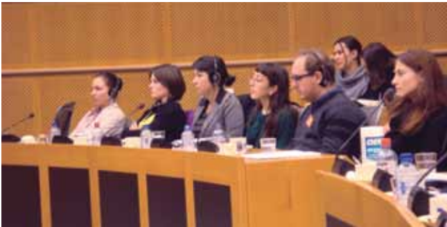
PICUM volunteers listen intently during the European Parliament hearing co-organized by PICUM on “Preventing Undocumented Pregnant Women and Children from Accessing Health Care: Fostering Health Inequalities in Europe.”

PICUM would like to thank the following individuals for their invaluable contributions to our newsletter in 2010: