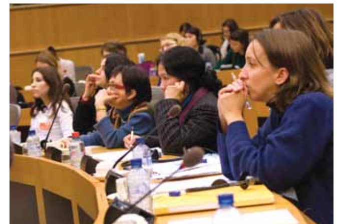
Participants listen intently during the European Parliament hearing co-organized by PICUM on "Preventing Undocumented Pregnant Women and Children from Accessing Health Care: Fostering Health Inequalities in Europe."